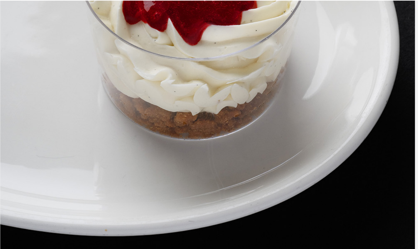
Home made Raw raspberry cheese cake