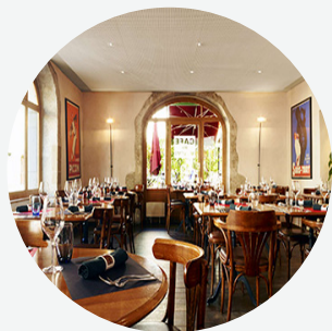
CAFÉ DES NÉGOCIANTS