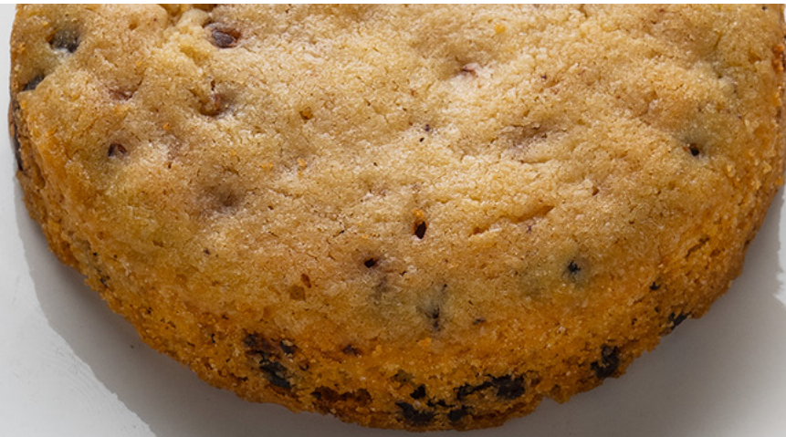
Chocolate chip cookie