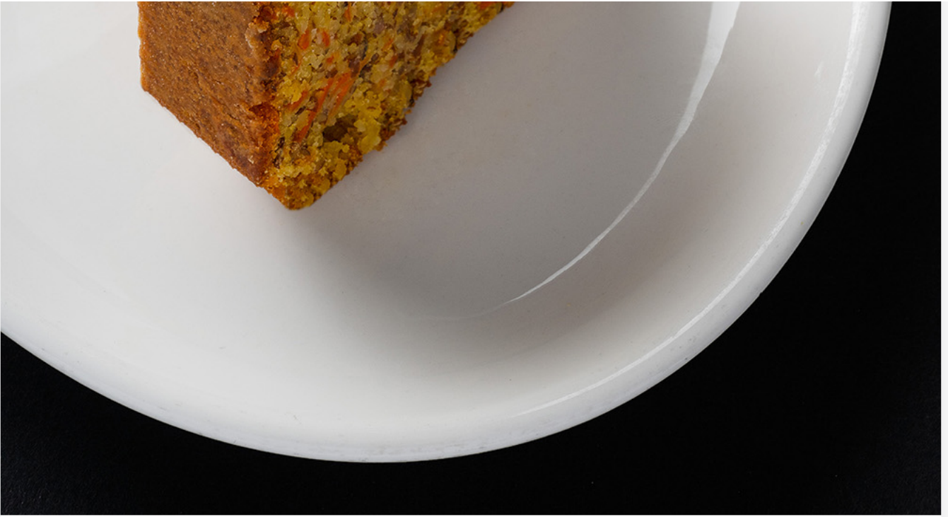
Home Made Carrot Cake